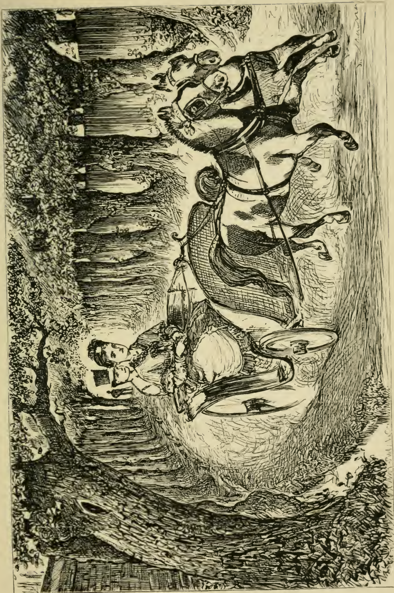
SHE LESSEMED IN HIS GAZE, AND WAS SOON OUT OF SIGHT.